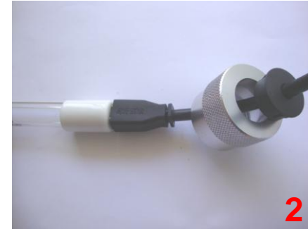
Pass the power adapter cord through the UV filter cap, and then plug in the power adapter with the UV bulb.