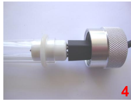
Slide sleeve through the UV Bulb.