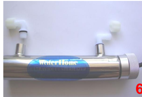
Screw in the elbow fittings on both sides.