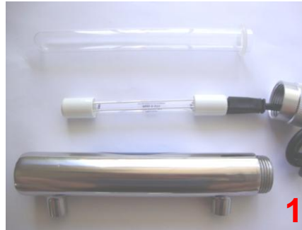
Open the cap of the UV filter housing.