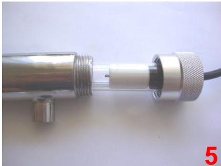
Carefully insert the UV bulb into the housing, and screw it in.